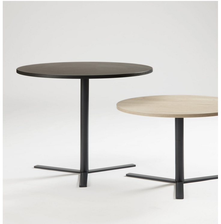
Table programme for collaborative spaces.

Structure with a column \text{\O}50\text{mm} diameter, 2mm thick steel tube.