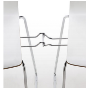
Ganging clip / KB