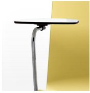
Writing pad / KB Easily removable HPL (high-pressure laminated) writing pad.