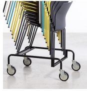
Stacking trolley / KB