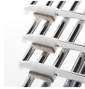
Riveted felt glides / KB