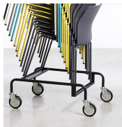
Stacking trolley / KB