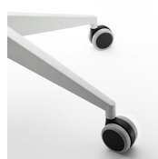
Soft castors / KB