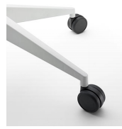
Hard castors / KB