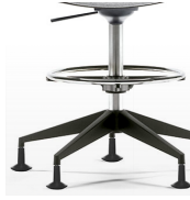
Piston height adjustment and footrest / KB