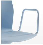
Closed arms / KB Powder coated, chromed or gloss.