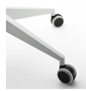
Soft castors / KB