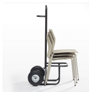
Stacking trolley / KB