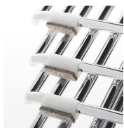
Riveted felt glides / KB