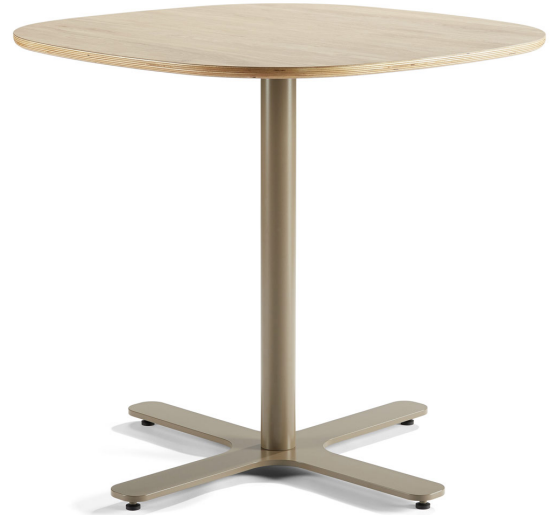
Table programme for collaborative spaces.

Structure with a column Ø60mm diameter, 2mm thick steel tube.