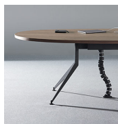
Flexible cable riser / BL Flexible cable riser. White & black.