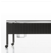
Modesty panel 268 mm / BL