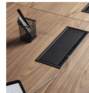
Top access / BL