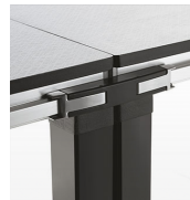
Table ganging clips / BL