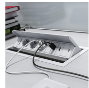
Kit electrificación / BL Kit electrificación apertura 50°