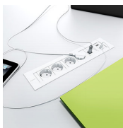
Kit electrificación / BL Kit electrificación sobre encimera