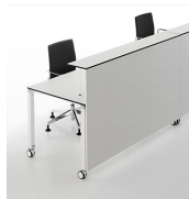
Modesty panel 568 mm / BL