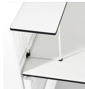
Modesty panel or skirt / BL