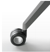
Hard castors / AR