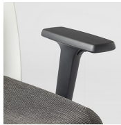
Adjustable arms / AR 2D or 3D