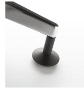
Slider glides / AR