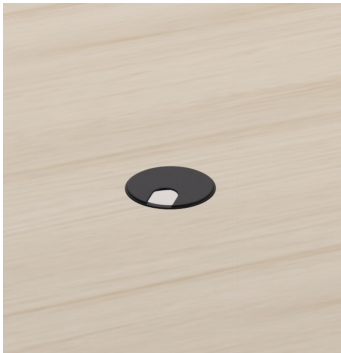
Top Access - AC052 Ø96mm support / Ø80mm cut out. White, black or grey colour.