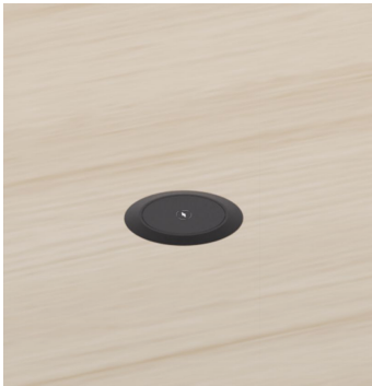
Multicharger Pro - AC085 Ø80mm support / Ø71mm cut out. Wireless charging + USB A and C. Black colour.