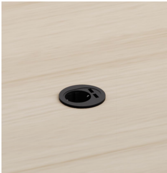
USB Charger - AC083 Ø70mm support / Ø60mm cut out. 1 schuko + 1 USB charge A and C. Black colour.