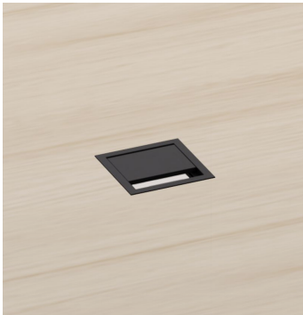
Top Access Square - AC063 100x100mm support / 93x93mm cut out. Top access square in metal. White or black colour.