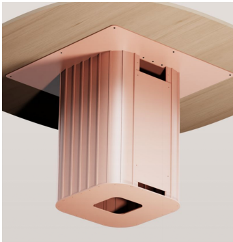
Electrified Central Column Central colum with side access and central column with double access for electrification. Customisable colour.