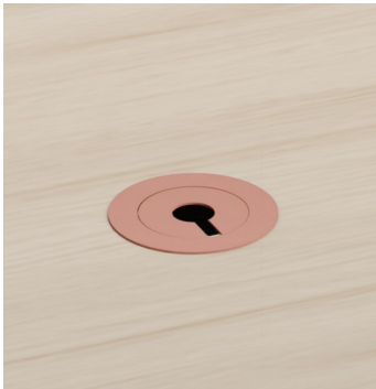
Top Access Round - AC072 Ø140mm support / Ø102mm cut out / Ø80mm passage. Round metal top access with removable cover. Customisable colour.