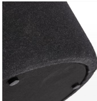
Glides / TO