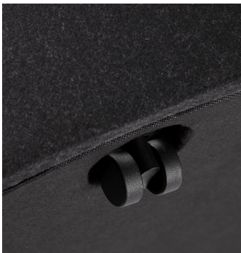
Hard castors / TO