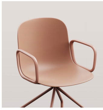
Arms - AC034 / AC038 Powder coated arms or polished arms.