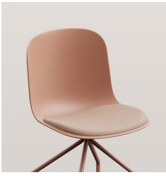
"ExtraSoft" - AC102 / AC103 Seat or fully upholstered "extra soft".