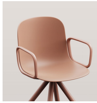
Arms - AC034 / AC038 Powder coated arms or polished arms.