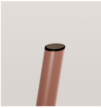
Felt Glides - AC079