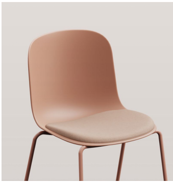
"Extra Soft" - AC102 / AC103 Seat or fully upholstered "extra soft".