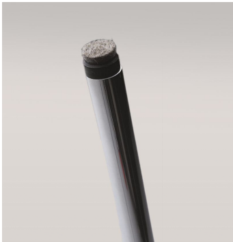
Felt Glides - 270/A