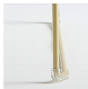
Riveted felt glides / AD