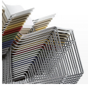
Stacking and transport trolley / AD