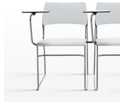
Writing pad & ganging clip / AD Ganging clip concealed under the seat. HPL (high-pressure laminate) writing pad, removable with no need for tools.