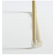
Riveted felt glides / AD